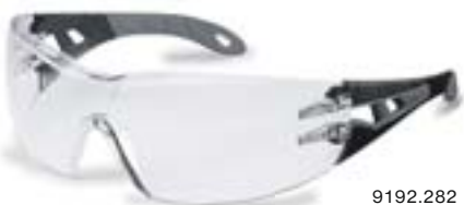
9192.282 narrow version