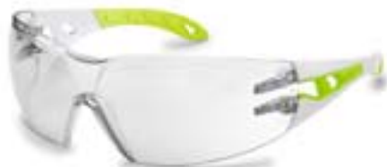
9192.725 narrow version

uvex pheos s · uvex pheos guard · uvex pheos s guard