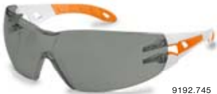
9192.745 narrow version