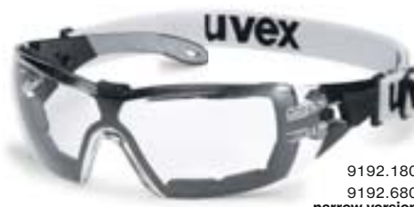
9192.180 9192.680 narrow version