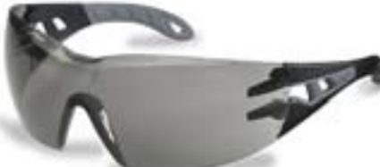
9192.283 narrow version