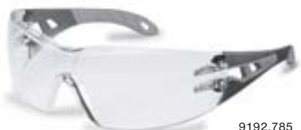
9192.785 narrow version