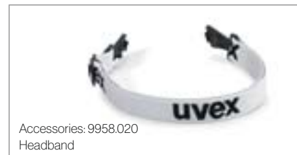
Accessories: 9958.020 Headband