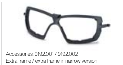
Accessories: 9192.001 / 9192.002 Extra frame / extra frame in narrow version