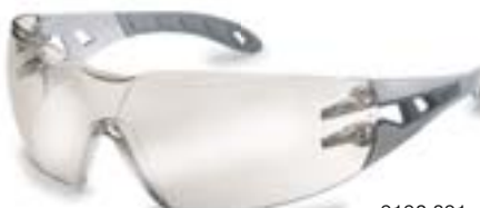
9192.891 narrow version