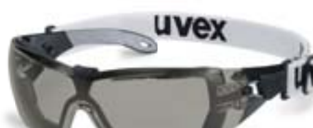
9192.181 9192.681 narrow version