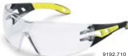
9192.710 narrow version